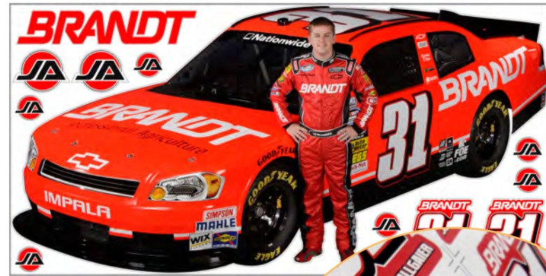
20" x 40" wall graphic