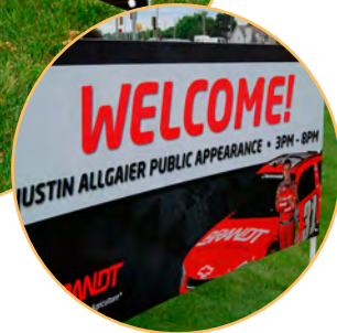
4' x 8' coroplast signs mounted on posts